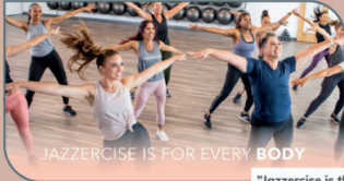
JAZZERCISE IS FOR EVERY BODY

"Jazzercise is the most fun way to keep fit and make new friends. I love how motivational the instructors are"